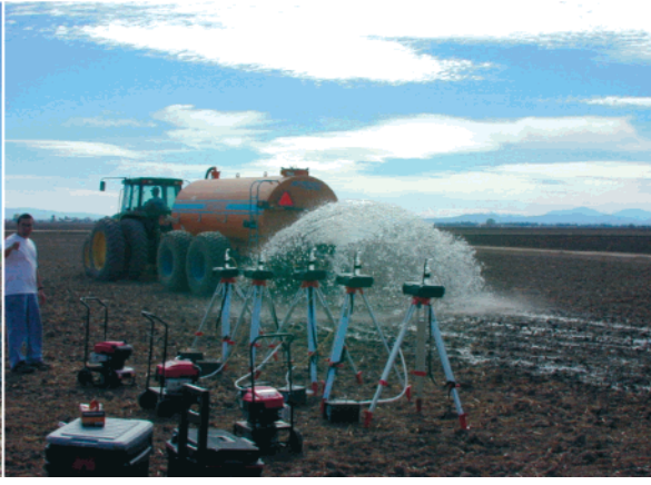
FIGURE 3. Biosolids spray (left) and seeded groundwater spray (right).